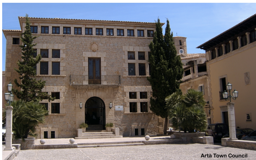
Artà Town Council

The route sets off from the centre of Artà at Plaça del Conqueridor square towards Canyamel. The first 6 km runs along a completely flat road. At the roundabout, you turn off towards Son Servera up Coll del Vidrier hill, continuing uphill for 1.1 km until km 7.3. Between km 14.5 and 15.2 the road begins to climb again to Coll de la Gravera hill at Son Servera.